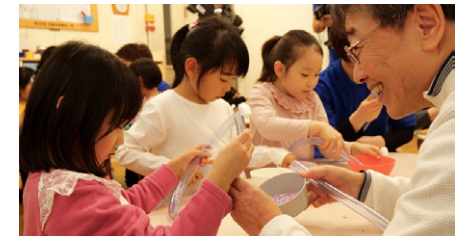
Workshop to make steering wheels for the exercise