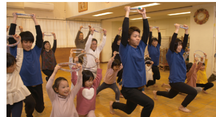
Wheel Spinning (Guru-Guru) Exercise

The exercise has three main benefits: improving circulation to help refresh the body, building strength through a somewhat strenuous motion, and stimulating the brain to enhance cognitive abilities. So they are easy to remember, all the moves are completed in four beats over three seconds and the movements are repeated in a rhythmical manner. The exercise can be performed before operating a vehicle or any time one has some time to spare. It can also be done without the steering wheel prop and it is also effective to a degree, even if it is done while sitting and watching television or listening to music. A video showing senior citizens, pre-school children and university students performing Wheel Spinning (Guru-Guru) Exercise and participants enjoying a workshop to make their own one-of-a-kind steering wheels to be used in the exercise was posted to Facebook, YouTube, and Twitter.