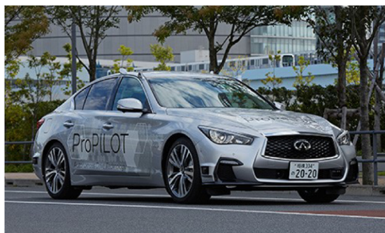
A Nissan autonomous driving test vehicle.

We are enhancing our preventive safety technologies to support the four basic steps in avoiding accidents: sensing, cognition, judgment and action. Today we are developing autonomous driving technologies as the next step in our approach to driving safety. We believe that autonomous driving