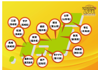
Regions participating in the campaign to turn on headlights