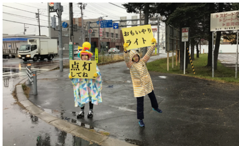
Volunteers in Obihiro, Hokkaido calling for drivers to turn on their headlights

Throughout the year, Global Headquarters Gallery hosted daily presentations at dusk by Nissan's "Miss Fairlady" PR staff members about the Omoiari Light Promotion. From 2019 they have been holding up signboards that encourage turning on headlights while they explain. By urging greater awareness of, and action on, safety among corporations, nonprofit organizations, car-lovers and other stakeholders, these activities have helped our Omoiari Light Promotion steadily gain broad acceptance among the public.