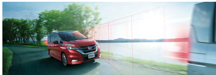
Serena with ProPILOT.

Nissan has a clear roadmap in place for its development of Autonomous Drive technologies. The year 2018 will see the launch of autonomous driving capability on multiple highway lanes, and by 2020 we plan to introduce autonomous driving on local roads.