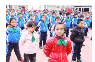
Elementary schoolers in a ceremony to welcome Nissan employees

In 2012, Nissan South Africa (NSA) provided a mobile eye clinic that screened 11,482 schoolchildren and dispensed 597 pairs of prescription eyeglasses. The mobile team referred 650 students requiring more advanced eye screening to specialist clinics. This is part of the Nissan Mobile Child Eye Health Project, which has been running for the past three years. This activity helps children from disadvantaged backgrounds to get access to eye-care, thus increasing their ability to learn effectively.