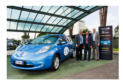
Nissan LEAF plays a valuable supporting role in nonprofit activities.

Nissan has partnered with Fleet Forum, an NPO headquartered in Geneva, with the goal of helping to reduce the environmental impact of vehicles used in nonprofit activities. We provide Nissan LEAF electric vehicles through Fleet Forum to five U.N.-affiliated and other organizations for fixed periods, free of charge. We will continue our support in fiscal 2013.