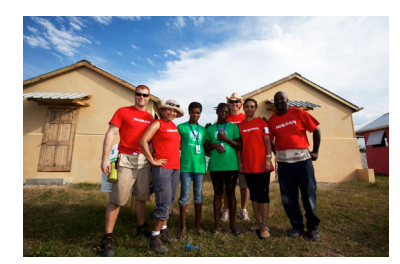
NNA employees participated in Haiti reconstruction.

Nissan North America (NNA) launched a project with Habitat for Humanity to send volunteers to Haiti. Employees in North America were invited to apply, and five were selected from many applicants, based on essay submissions. Employees joined volunteers from all over the world and participated in a large-scale construction project from November 21 to December 1, 2012.