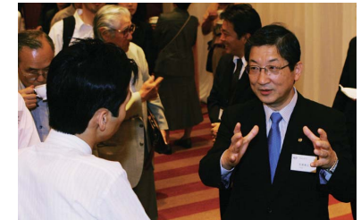
Nissan executives mingle with shareholders at the post-meeting informal gathering.