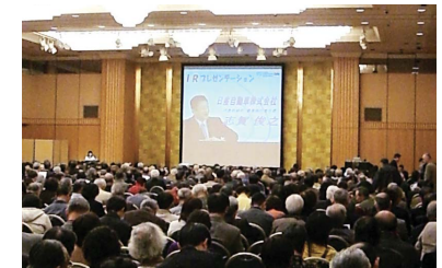
A presentation at a Nissan investment forum