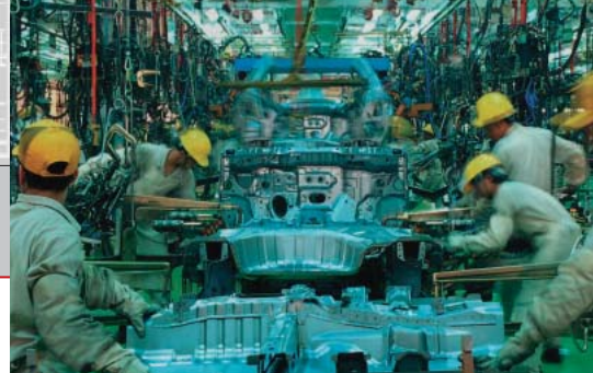
Dongfeng Motor Co., Ltd. Guangzhou Huadu plant (China)