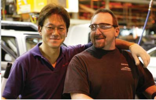
Nissan North America, Inc. Smyrna Plant (USA)