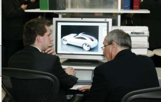
Nissan Design Europe, design center in London (UK)