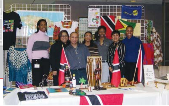
An event to appreciate diversity at Nissan Canada, Inc.