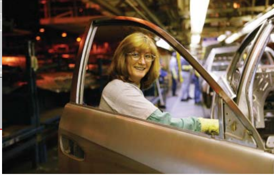
Nissan North America, Inc. Smyrna Plant (USA)