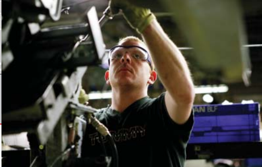
Nissan Motor Manufacturing (UK) Ltd.