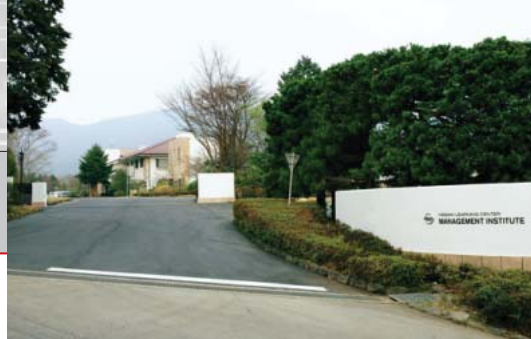
Nissan Learning Center Management Institute (Japan)