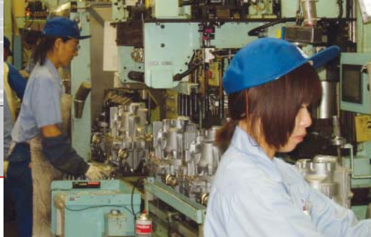
An assembly line with reduced workload, allowing female workers to operate the whole line without the assistance of male workers (Aichi Machine Industry, Japan)