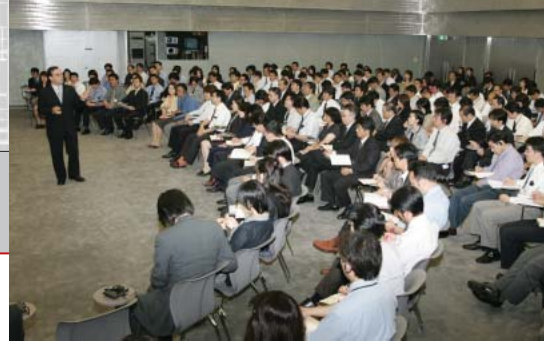
Meeting between CEO and employees at Nissan Motor Co., Ltd., for the free exchange of opinions

We have introduced a career development system that supports independent, proactive behavior. Nissan Motor Co., Ltd. has long had an "Open Entry System" in which employees are free to apply for any positions that are openly advertised. About 300-400 employees apply every year, and 70-80 of these employees are transferred. In addition, in fiscal year 2005, we introduced a "Free Agent System" in which employees can freely apply to any department in which they would like to work. We are considering the introduction of this same system for affiliated companies, ensuring "the right person for the right job."