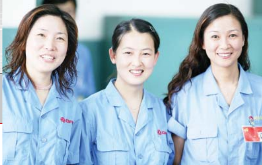
Dongfeng Motor Co., Ltd. (China)