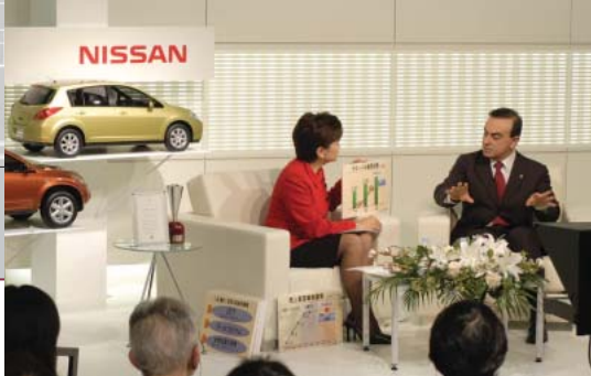
Seminar for individual investors co-sponsored with Nikko Cordial Securities Inc. (Japan)