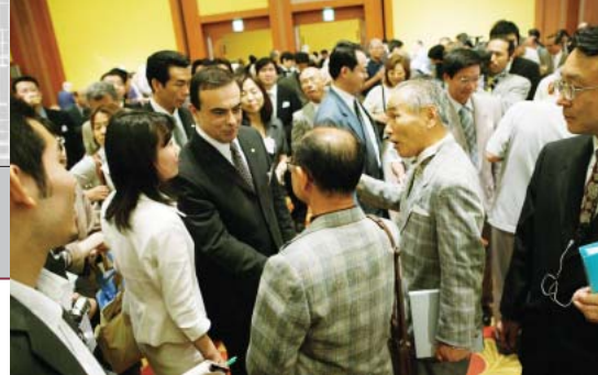
Informal reception with shareholders (Japan)